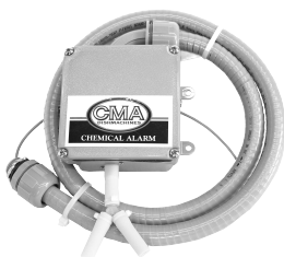
Low Chemical Alarm