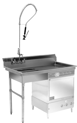
48" Undercounter dishtable with Pre-Rinse